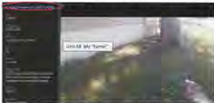
Larger picture in Footnote #19

This document and the attachments do not describe the entirety of events after I moved from Minnesota to lease this property. Just one that has not been mentioned: Arendt substantially alters the facts of the sewage left on the lawn for 18 days (8/22-9/8) 19 even claiming it was on the "neighbor's lawn" 20 and properly capped 21 promptly" (1 month later & only after Wood Co Health Dep't visit on 10/4 that resulted from my complaint to them).