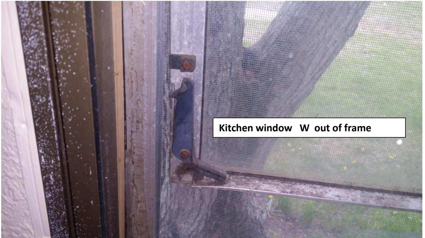
Kitchen window W out of frame