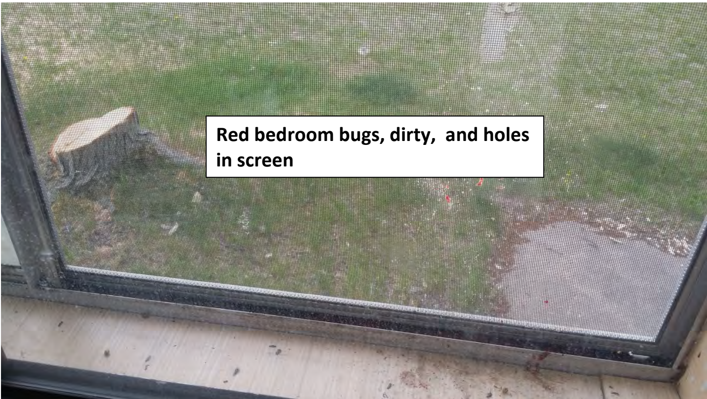
Red bedroom bugs, dirty, and holes in screen