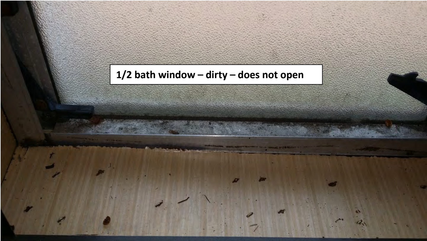
1/2 bath window – dirty – does not open