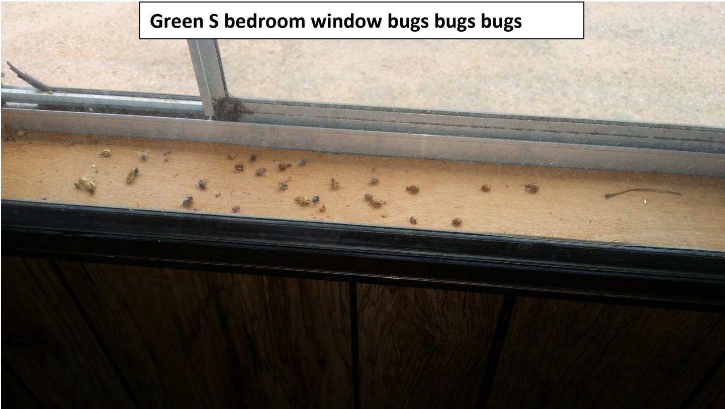
Green S bedroom window bugs bugs bugs