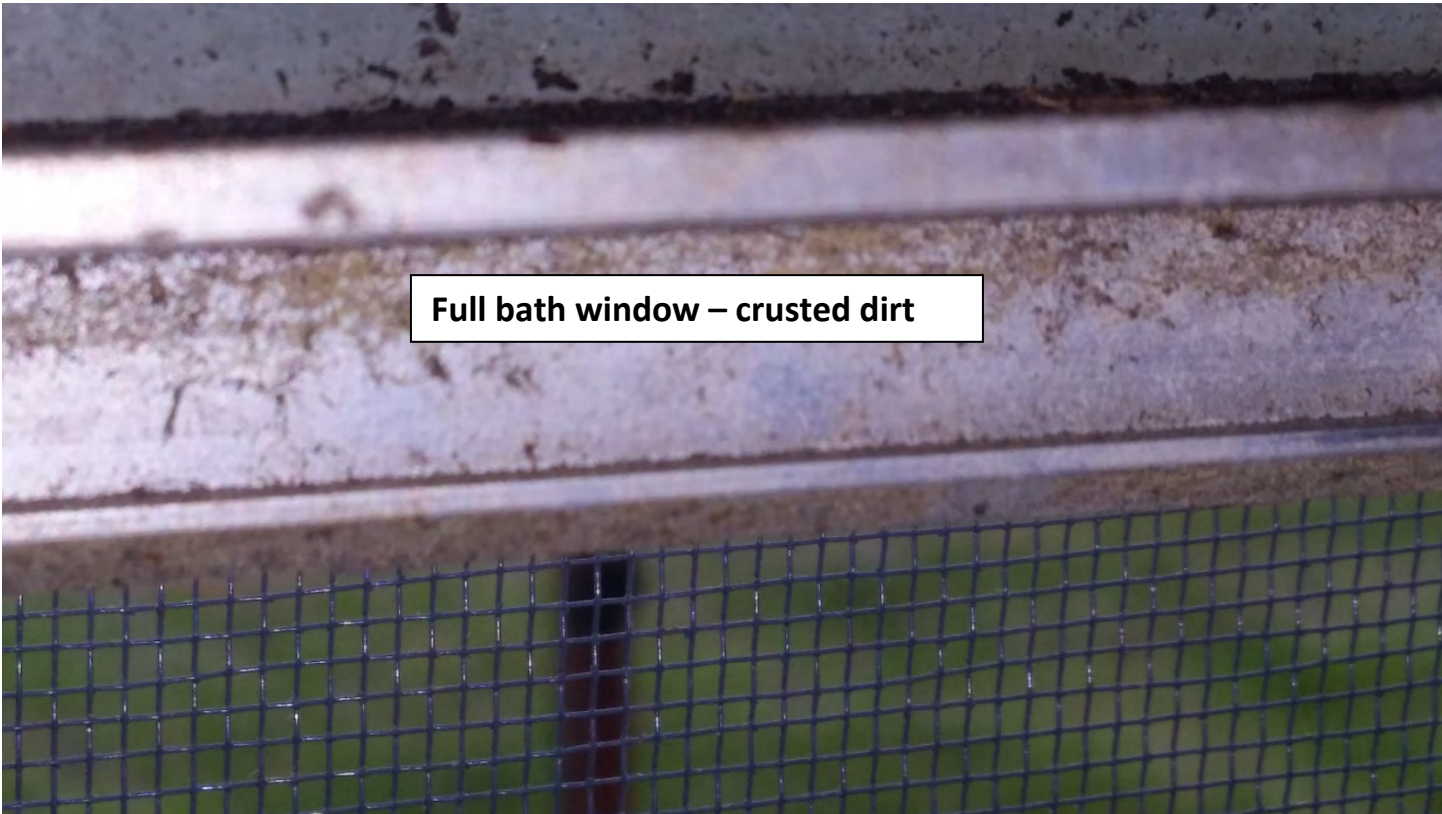
Full bath window – crusted dirt