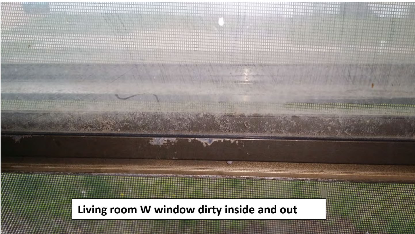
Living room W window dirty inside and out